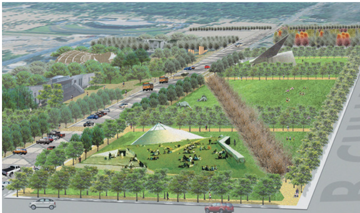
Hargreaves & Associates